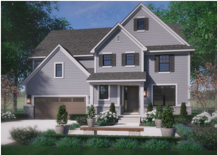
Barclay II 1W