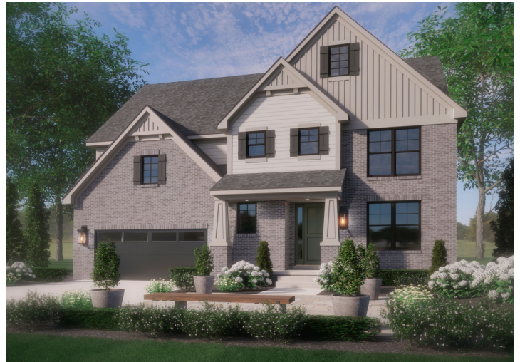
Barclay II 2W