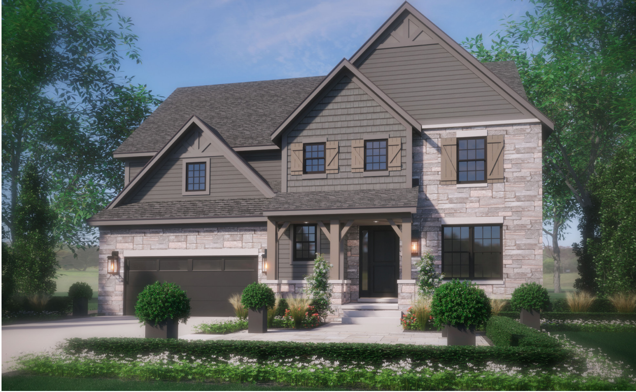
Barclay II 3W