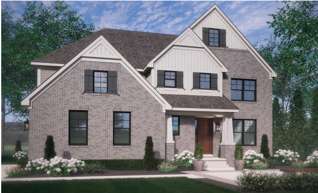
Barclay II E