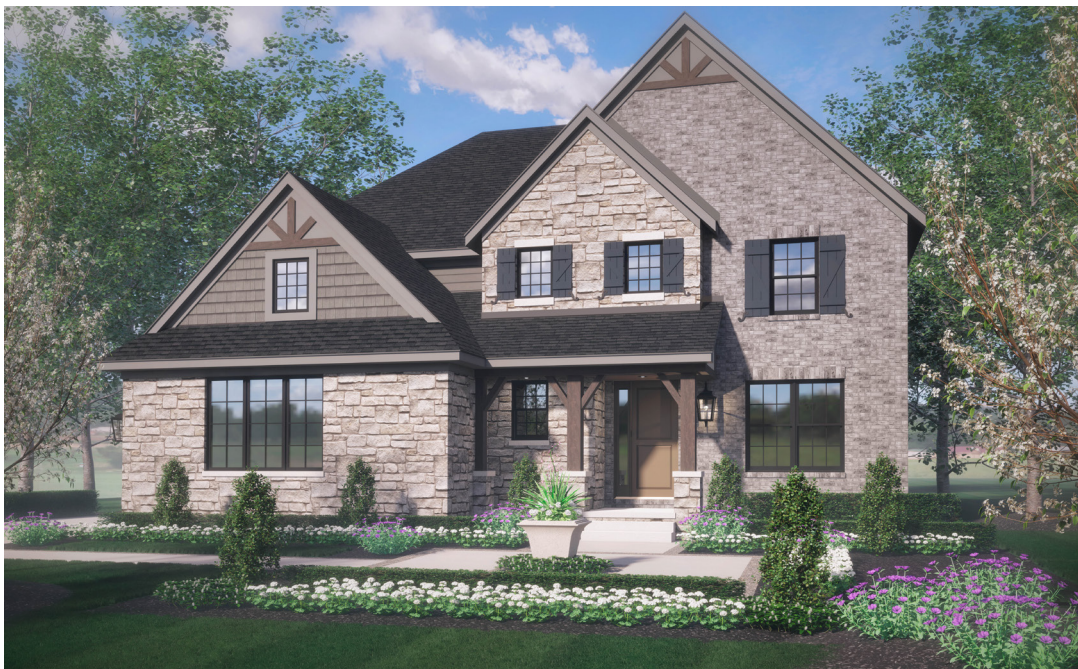
Barclay III E