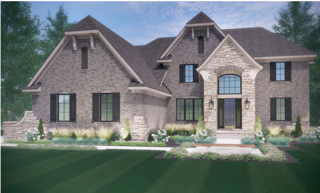
Pinehurst II B