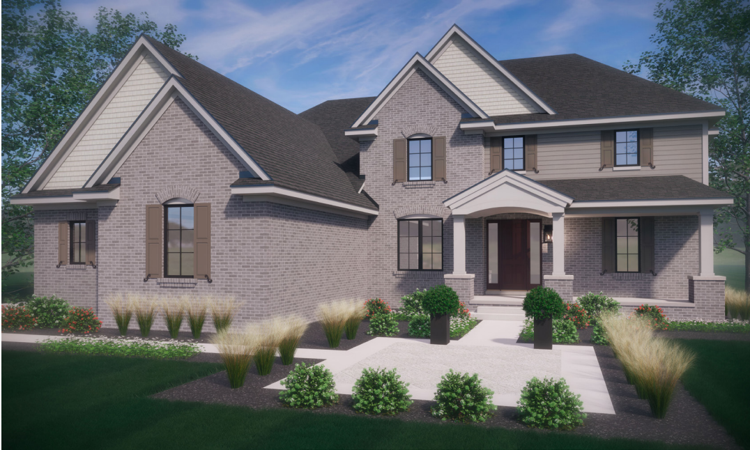
Pinehurst II A